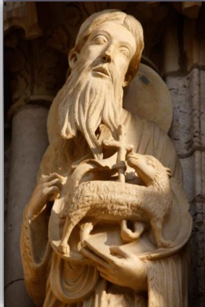
All of us wear the expression of the John the Baptist of Chartres: craving an absent good.

And this makes him, par excellence , a saint of Advent. This holy season, of course, calls to mind the coming (adventus) of Jesus in history, but it also anticipates the arrival of the Lord at the culmination of the age, that time when, as St. Paul puts it, Christ will be “all in all” (1 Cor. 15:28). This fulfillment, obviously enough, has not yet happened, for the world is still plagued by wars, famine, floods, earthquakes, and pandemics. And our lives are still marked by depression, failure, sin, and frustrated plans. None of this tells against the