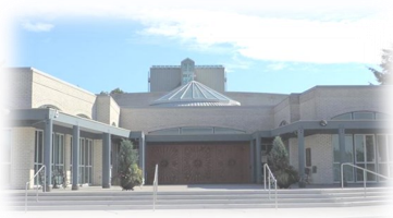
GOOD SHEPHERD CHURCH (since 1994) 2250 - 150 Street Surrey V4A 9J3

to follow Jesus Christ and to invite others to do the same.